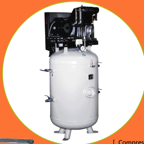
[ Compressor ]