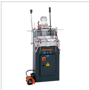
1-spindle copy router AS 70/44