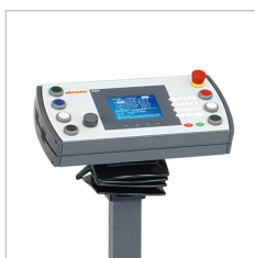
Positioning control E 355