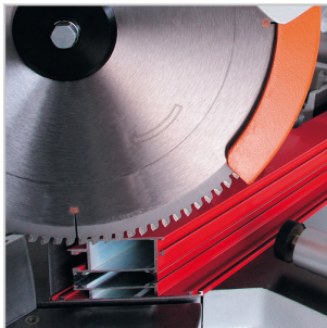
Double mitre saw DG 79