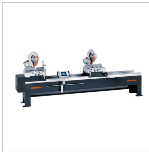
Double mitre saw DG 79 M DG 79 M + E 355