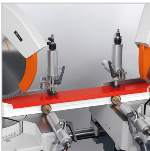
Double mitre saw DG 79