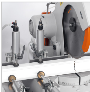
Double mitre saw DG 79