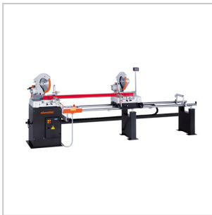
Double mitre saw DG 79 DG 79 + E 111