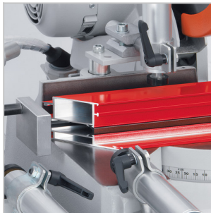
Double mitre saw DG 79