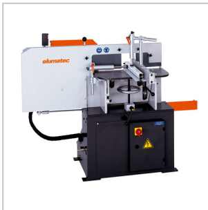
End milling machine AF 222/02