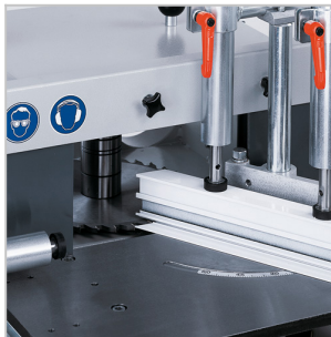
End milling machine AF 222/02