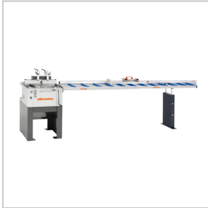
Length stop and measuring system MMS 100