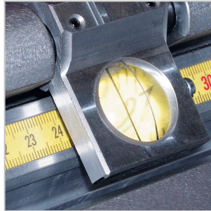
Length stop and measuring system MMS 100