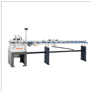
Length stop and measuring system MMS 200