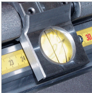
Length stop and measuring system MMS 200