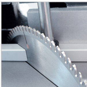
Table saw TS 161