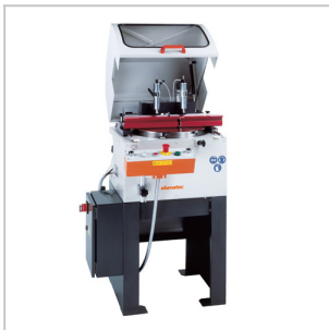
Table saw TS 161/30