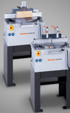
TABLE SAW TS 161/00