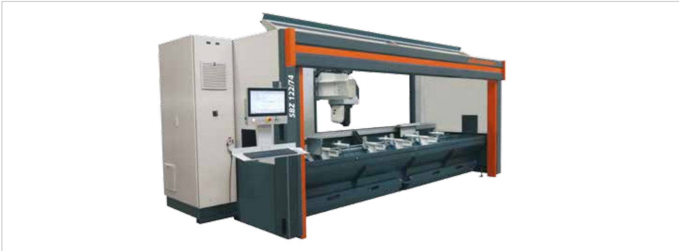
Profile machining centre SBZ 122/74

Whether the batch size is 1 or 1000: the 4-axis profile machining centre SBZ 122/74 ensures high throughput. Designed for high speeds, it processes a large number of units within a short time and with a high degree of accuracy. In case of small quantities, parallel processes reduce the non-productive time within the manufacturing cycle. It will benefit industrial customers and metal engineering companies who process aluminium, reinforced PVC profiles, or light steel profiles.