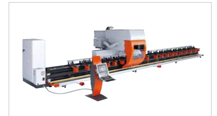
Profile machining centre SBZ 151