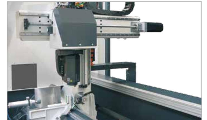
Continuously adjustable angle setting from -120° to +120° (A-axis)

In addition, the regulator retrieves the optimal parameter set for every tool, such as drill, disc milling cutter or router, to achieve the best machining result. “With all these features, SBZ 122/74 creates the basis for high throughput, and supports the user in achieving an important objective: reducing unit costs”, concludes Achim Schaller.