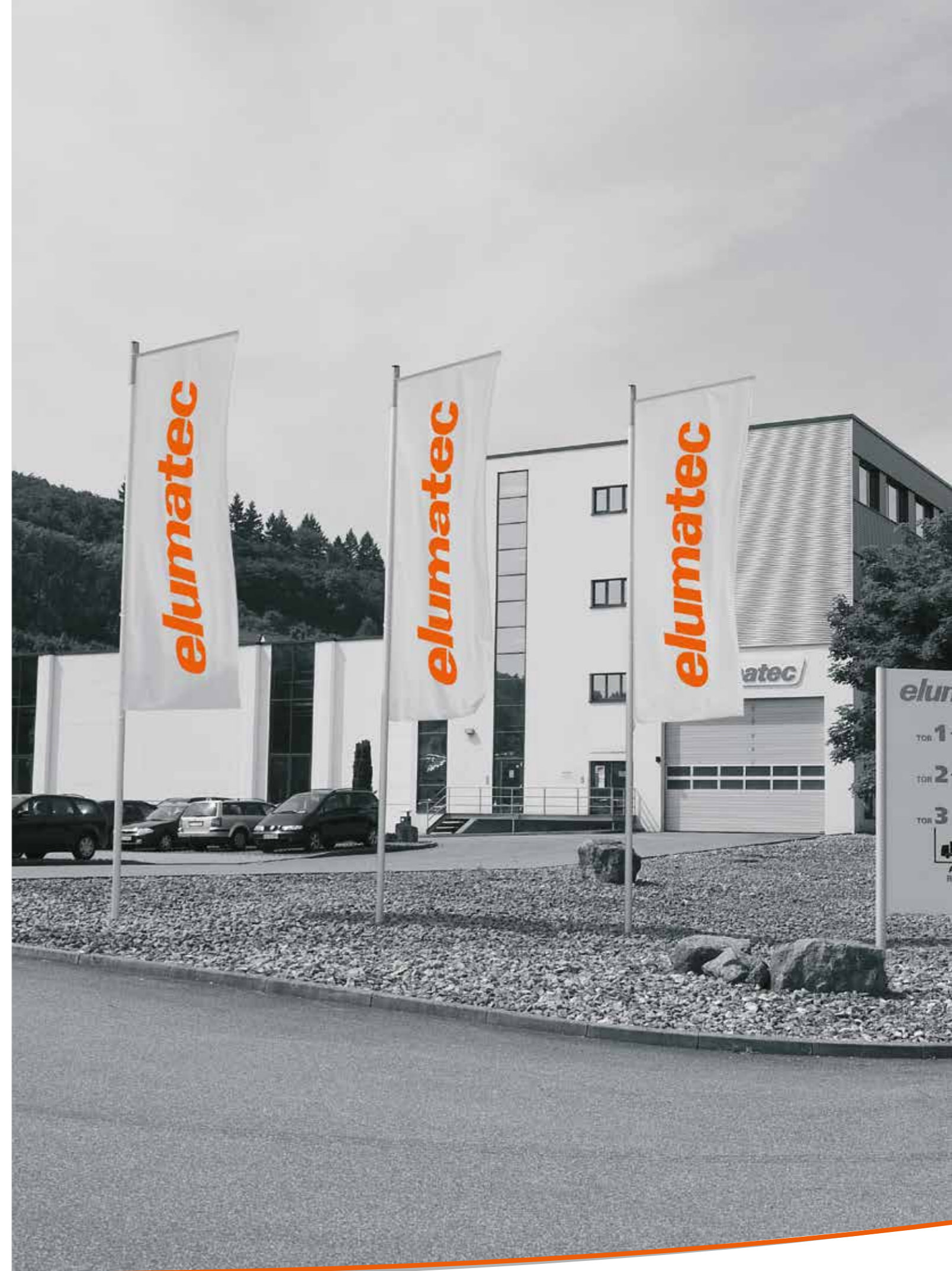
Head of Sales and Marketing elumatec AG