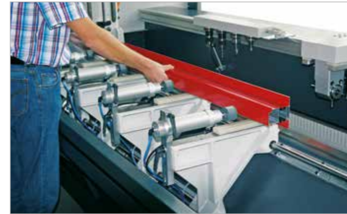
Machine bed that is executed as a modern „inclined bed“

The clamp axis has a separate servomotor, which allows for adjusting multiple material clamps simultaneously. In addition, the linear bearings increase the clamp rigidity.