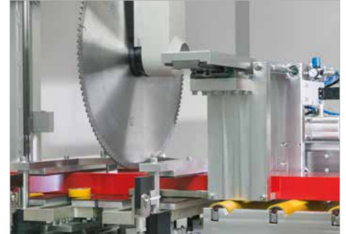
Continuously pivoting saw blade

The SBZ 628 is very compact, and it requires only a relatively small footprint. The machine's fast installation and elumatec's after sales service left a lasting impression on Tiedt: „It's great when people live their enthusiasm on the job. elumatec's support is exemplary.” The initial training went smoothly.