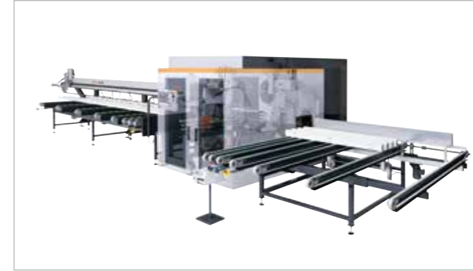
Profile machining centre SBZ 630