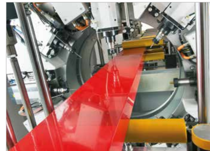
Innovative rotary module, equipped with eight spindles

The enormous flexibility of the SBZ 628 also contributes to speed and productivity. Thanks to numerous machining options and adaptable clamping technology, it covers a wide range of tasks in the fields of windows, doors, and facades. Despite different profile types, conversions are the exception, not the rule. The pass-through centre processes profile bars vertically or horizontally, even in large diameters. The SBZ 628 performs milling and drilling tasks with its innovative rotary module, which is equipped with eight spindles. Only special cases, such as block windows, in which the frame covers the window sash, require a tool change. Apart from on-the-fly machining, Tiedt & Iden also uses stationary machining, for example for milling lock cases for doors. In such heavy-duty tasks, the combination clamping system ensures additional process reliability. The profile bar is redirected towards the integrated saw after machining. The max. 650 mm saw blade with stepless pivoting can approach the profile bar from three sides and perform a number of cuts.