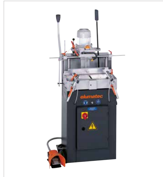
1-spindle copy router: today

Although the successors of the AS 70 have outperformed it, there has never been a break in production. The AS 70 is still being sold worldwide, because elumatec has repeatedly adapted it to new market requirements and technical developments. For example, the pneumatic material clamping unit has been modified, and the machine has also been equipped with a pulsed coolant system.