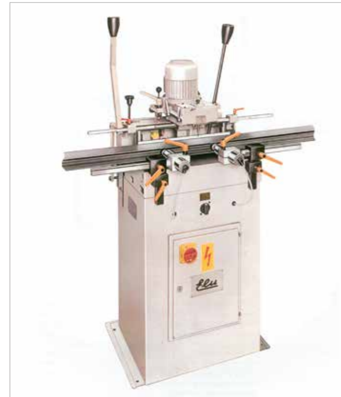
1-spindle copy router: 1966

Its characteristics, such as versatility, ease of use, and high routing precision with little effort, make the AS 70 a very popular copy router in smaller workshops. It is the ancestor of other stationary copy routers, which elumatec has brought to market over the years: the AS 170 1-spindle copy router, and the KF 78 and KF 178 multi spindle copy routers.